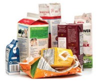
Paper cardboard, dairy and juice containers