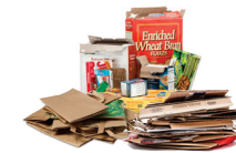
Chipboard, boxboard, brown paper bags and cardboard