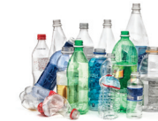
Plastic bottles and containers