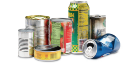
Aluminum foil, cans and empty aerosol cans